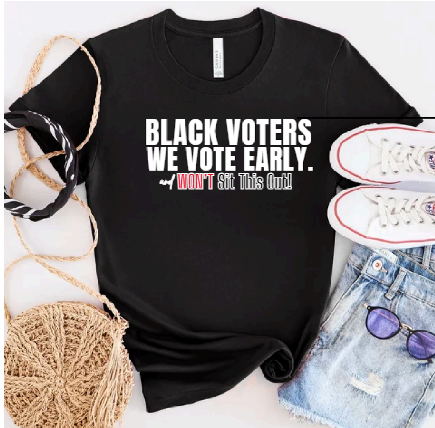
Civic Wear · 2026